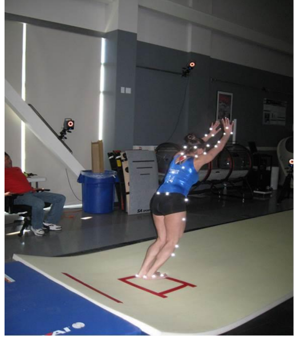
Figure 3. Take-off area with taped markings .

The cylindrical spring was 10.7 cm in height and 5 cm in diameter with 9 coils. The modified spring was more complex in design, 10.7 cm in height, and 5 cm in diameter at the top and widening to a 6.7 cm diameter near the bottom. The modified spring used six coils on the upper spring section and three coils on the lower. Figure 5 shows the two types of springs and the fastening bracket.