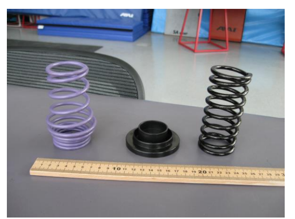
Figure 5. Modified spring on the left, spring end cap in the middle, and an cylindrical spring on the right.

<u>Instrumentation.</u> Kinematic 3D data capture and analyses were performed automatically by detection of 43, 14.5mm reflective markers using 10, Vicon<sup>TM</sup> T-Series T040 infrared cameras. The cameras were placed around the tumbling take-off area with four cameras on tripods low to the ground and six cameras on metal pipes mounted on the walls above the athlete. The Vicon-Nexus<sup>TM</sup> system was set to capture athlete marker motion at 200 Hz.