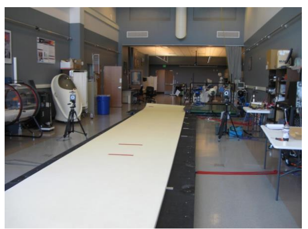
Figure 2. Spring strip as seen from the take-off end.

Equipment. The athletes performed a round off, flic flac (back handspring), back layout somersault on a tumbling strip (12.19 m x 2.41 m, 40 ft x 8 ft). The tumbling strip consisted of 2.41 m x 1.23 m x 0.013 m (8 ft x 4 ft x 0.5 in) panels of wood and fiberglass laminate. The tumbling strip was covered with continuous 12.8 m x 1.83 m x 0.05 m (42 ft x 6 ft x 2 in) foam matting (Figures 2 and 3). The matting was marked with red duct-tape near the take-off area 0.305 m (1 ft) from the edge. A start marking was used and represented the starting position of the athletes' tumbling sequences in their regular gym relative to their training gym floor exercise area and their regular foam pit landing area. А square of approximately 0.46 m was taped in red duct-tape as the take-off "target" for the feet of the gymnasts. This square was placed directly over the center of the takeoff spring panel at the end of the tumbling strip and directly over the four central springs. Thirty-two springs were attached in 37 cm squares encompassing the bottom surface of each spring panel as per manufacturer instructions (Figure 4). The springs were provided by American Athletic Incorporated (ELITE<sup>TM</sup> Power Spring, Jefferson, IA, USA) and Weller Spring<sup>TM</sup> (King Bar Sports, Carefree AZ, USA, Patent No.: US 7,993,244 B2 Patent No.: US 8,337,368 B2), hereafter referred to as the cylindrical and modified springs, respectively.