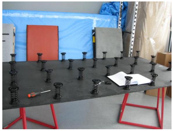
Figure 4. Spring arrangement on the underside of the spring strip panel.