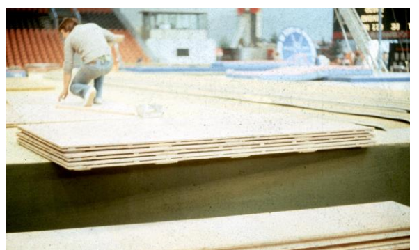
Figure 1. Side view of an older spring floor design made completely of wood. Note the small spacers that are strategically placed such that no two spacers lie on top of each other thus giving the floor the ability to flex when loaded.

surface with 5 or 10 cm (2 or 4 in) springs or foam blocks. The floor exercise supporting surface has transitioned from plywood to fiberglass-laminate panels and from 5 cm (2 in) to 10 cm (4 in) springs or foam blocks (Federation Internationale de Gymnastique, 2009). Internationally, the floor exercise apparatus has followed different design directions. For example, an early version included flexible wood panels separated in layers by staggered spacers that allowed the multilayer wood sections to rise and fall without interference (Figure 1).