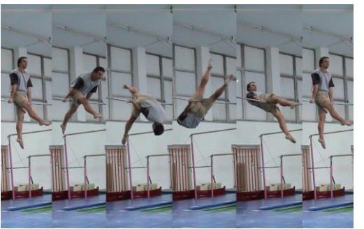
Figure 2. One leg circle forward (Čuk et. al. 2006, p.45).

By Wikipedia (2013) a blister is a small pocket of fluid (with or without blood) within the upper layers of the skin, typically caused by forceful rubbing (friction). Friction blisters, caused by rubbing against the skin, can be prevented by reducing the friction to a level where blisters will not form. This can be accomplished in a variety of ways: taping a protective layer of padding or a frictionreducing interface between the affected area, gloves should be worn when using tools sports equipment, a lubricant, typically talcum powder can be used to reduce friction between skin and apparel in the short term. People put talcum powder inside gloves or shoes for this purpose, although this type of lubricant will increase the friction in the long term, as it absorbs moisture. Increased friction makes blisters more likely. Blisters are treated like wounds. To prevent hands from blisters proper hand care is advised (proper hydration and tenderness of skin). Blister is quite common in everyday life (e.g. feet) and sport (feet, hands).