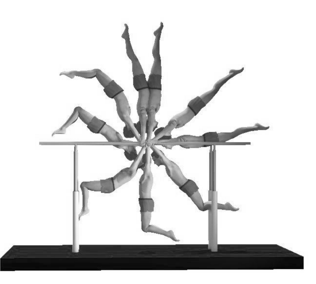
Figure 1. Representative giant swing backwards on the parallel bars at selective positions. Motion is in the clockwise direction.